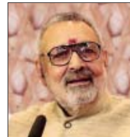
Giriraj Singh Union Minister of Textiles, Govt. of India

The IHGF Delhi Fair is known for creating new opportunities by bringing together leading Indian businesses and attracting buyers from around the world. With a skilled workforce and access to diverse raw materials, India's handicraft sector has significant potential for innovation and customization.