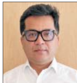
Pabitra Margherita Union Minister of State for External Affairs and Textiles, Govt. of India

EPCH's dedicated efforts have greatly boosted the Indian handicrafts sector, promoting its exceptional craftsmanship and securing a strong global presence.