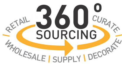
IHGF DELHI FAIR BUYERS INTEREST MATRIX

The fair's 14 segments in Home, Fashion, Lifestyle, Furnishing and Furniture are to offer choice of over 2000 products and more than 300 trend specific design developments through extensive product presentations in housewares, home furnishings, furniture, gifts and decor, lamps and lighting, Christmas and festive decorations, fashion jewellery and accessories, spa and wellness products, carpets & rugs, bathroom accessories, garden accessories, educational toys & games, handmade paper products and stationery, as well as leather bags & cases. Visitors can explore India's unique product offerings that stem from contemporary design inspirations, authentic craftsmanship and a rich raw material base, resulting in curated selections of innovative and customizable pieces, alongside a unique range of modern, distinctive and high-end items. These highlight exceptional material quality and design excellence, as well as added value across home accents, decorative knick-knacks and practical utilities.